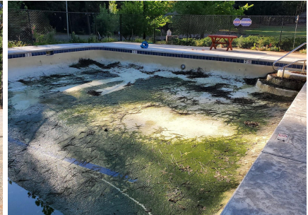
Occasionally cleaning a scummy pool