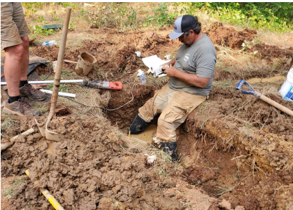
Sometimes fixing broken pipes