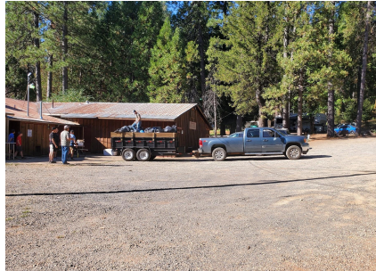
sometimes taking a trash load