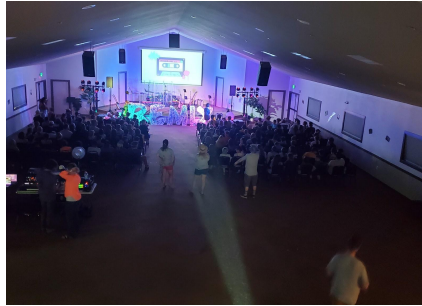
Guest Group Rockin Grace Chapel