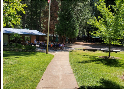
Guest Group Discipleship