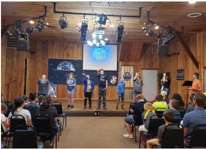
Mt Hope Kids Camp