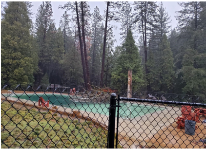
Tree into Fence & Pool