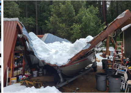
Shop Roof/Building Collapse