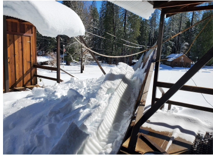
Dining Breezeway Collapse